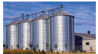
Agricultural Monitoring & Control